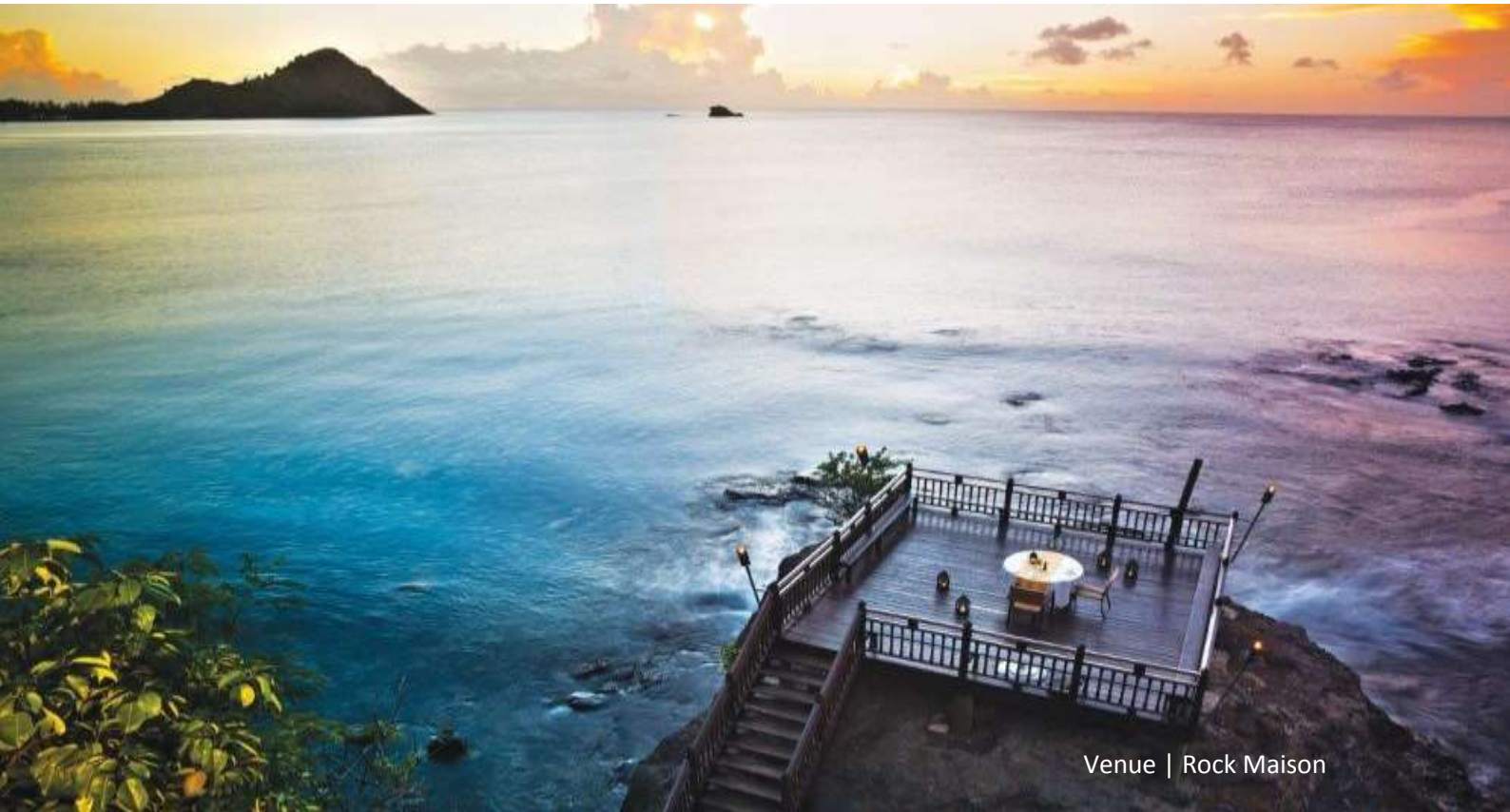
Venue | Rock Maison