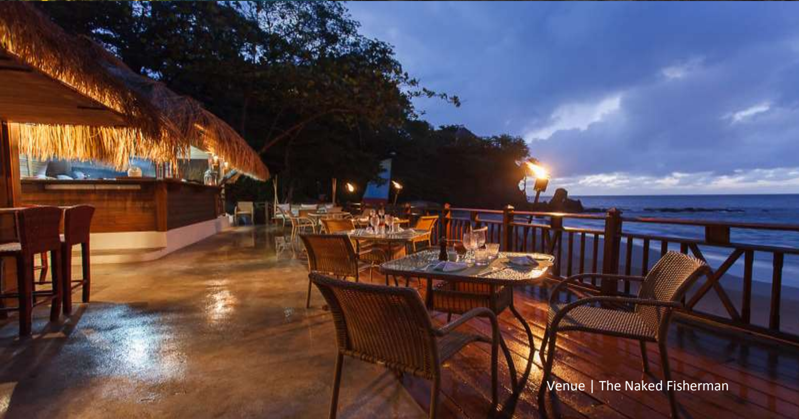
Venue | The Naked Fisherman